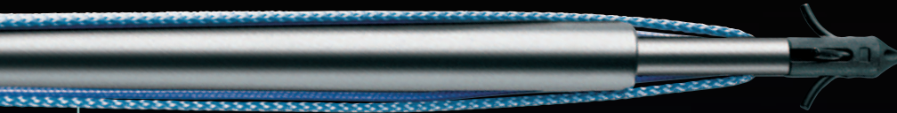
Super QUICKANCHOR Plus Dual Suture

NOW fully loaded with ORTHOCORD ™ Suture