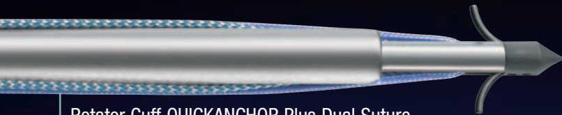
Rotator Cuff QUICKANCHOR Plus Dual Suture